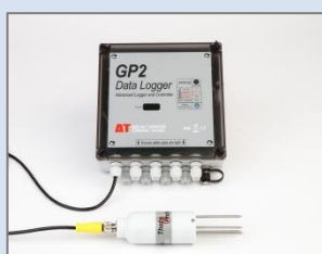
GP2 with ML3 ThetaProbe