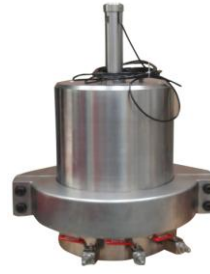
Fig. 7, 14MPa Triaxial Cell with 80mm sample height