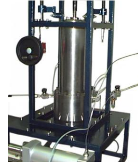
Fig. 10 GDS 10MPa Bishop and Wesley Cell