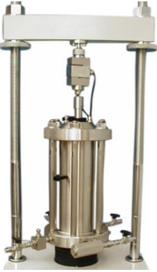
Fig. 5, 14MPa Passive Triaxial Cell

For triaxial cells that do not have balanced rams, accommodation needs to be made for the potential maximum ram upthrust (in particular high pressure triaxial cells). The load frame that the cell is being used in must be capable of taking the maximum ram upthrust. If this is not the case, a balanced ram solution can be considered. Porting is provided for local instrumentation.