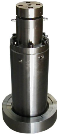
Fig. 4, 64MPa Triaxial Cell with balanced ram (HP64CL)

The balanced ram is a system that compensates for the up thrust on the ram exerted by the cell pressure. Our system utilises a secondary chamber around the ram that balances the pressure in the cell against a second piston seal such that the pressure load is not exerted onto the loadframe. This system usually means that a smaller range loadframe can be used to achieve the same deviator loadings on the sample. For example if a cell has a 50mm diameter ram and a cell pressure of 32MPa the up thrust would be approximately 63kN on the frame. This would have to be deducted from the maximum achievable deviator loading that a given frame can apply. With a balanced ram, the full load frame capacity may be used to apply axial force on the sample as there is zero ram upthrust. In addition, a balanced ram within a high pressure passive cell eliminates disturbance to constant cell pressure during axial loading.