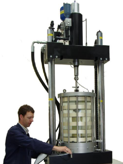
Fig. 3, 500mm Triaxial Cell