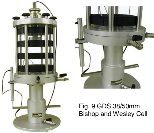
Fig. 9 GDS 38/50mm Bishop and Wesley Cell