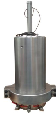
Fig. 8, 14MPa Triaxial Cell with 300mm sample height