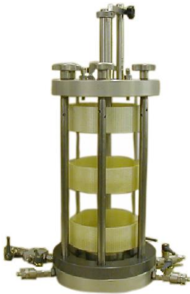
Fig. 2, 50mm Triaxial Cell

The Traditional Passive Triaxial Cells range in sample size from 50mm (see Fig. 2) through to 500mm, as used in our Large Diameter Cyclic Triaxial Testing System (see Fig. 3). All passive triaxial cells have ports to enable the measurement of cell, back and pore pressure, specimen volume change and a top entry ram for application of axial stress and displacement.