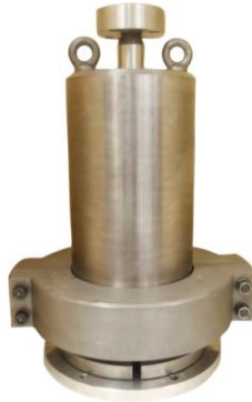
Fig. 6, 100MPa Triaxial Cell